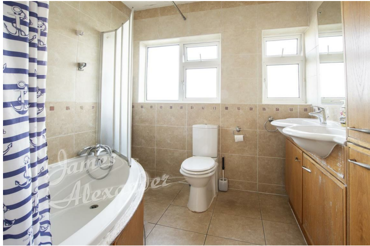
Shower Room 7'10" x 6'10" (2.40 x 2.10)